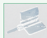
Cartridge 2.8 mm